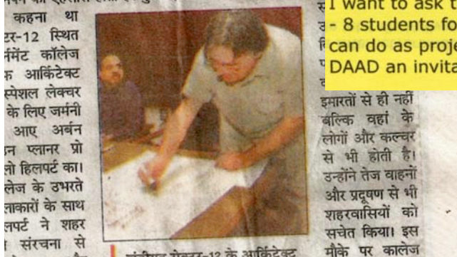
चंडीगढ़ सेक्टर-12 के आर्किटेक्ट