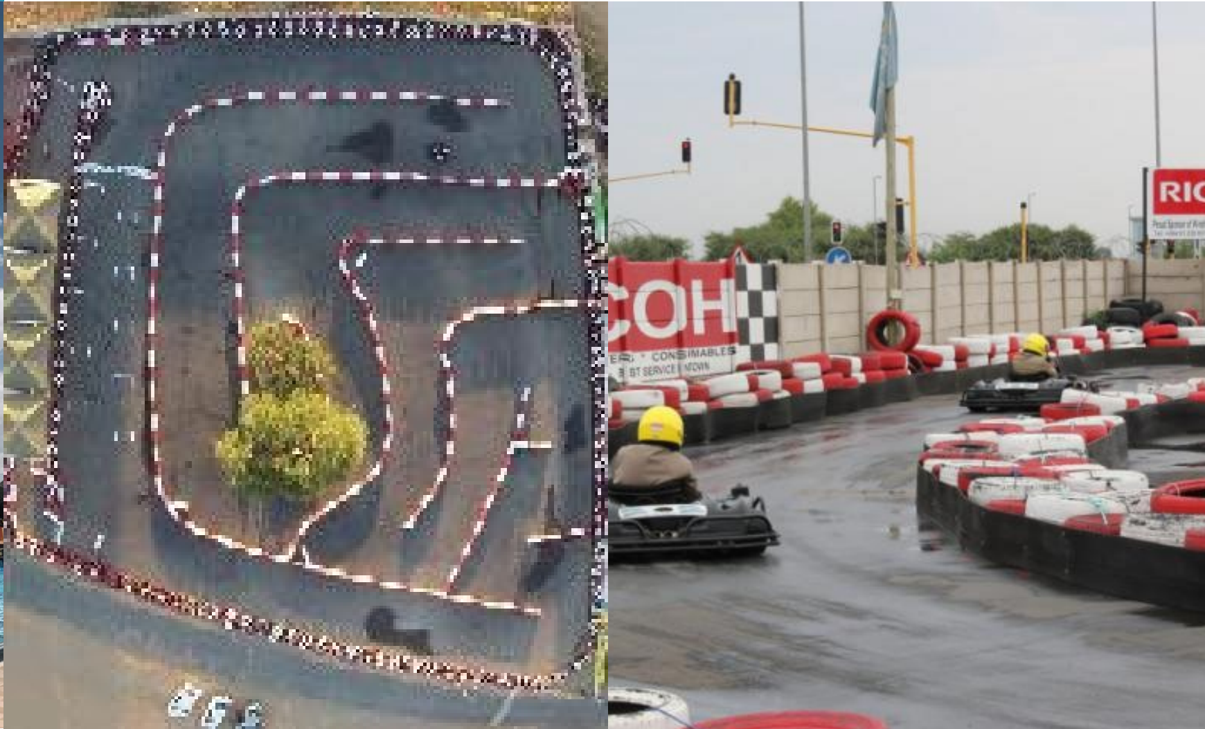
WINDHOEK GO-KARTING ENTERTAINMENT