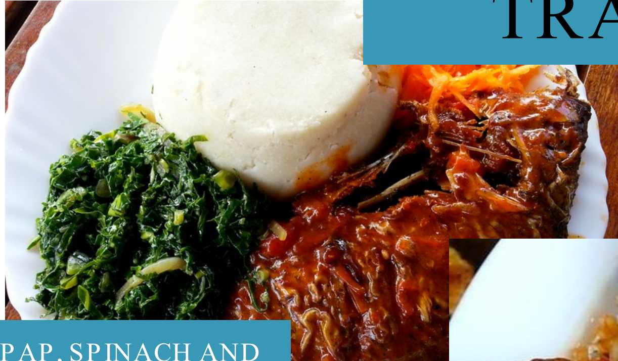
PAP, SPINACH AND VLEIS