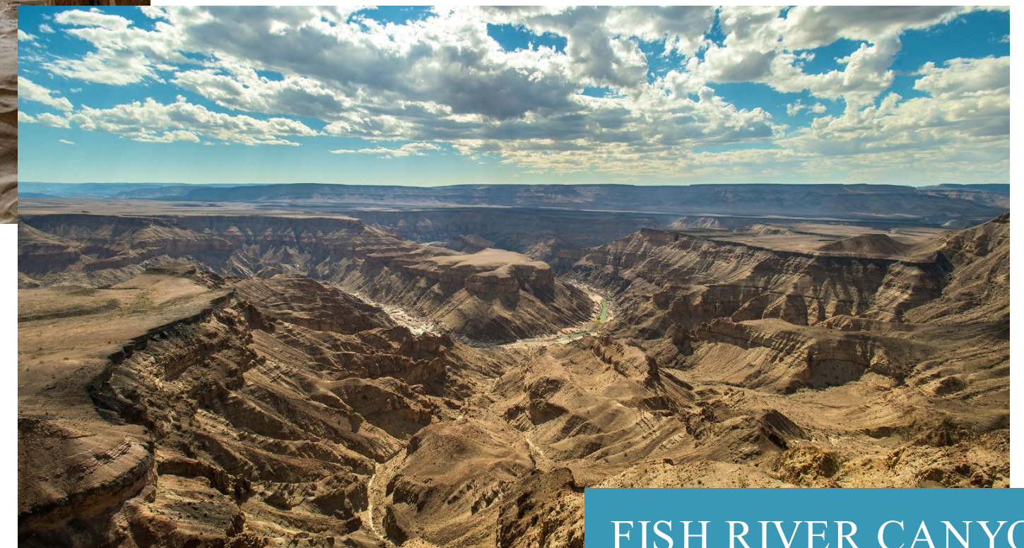
FISH RIVER CANYON